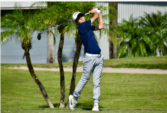
Student-Athletes Return to Competition